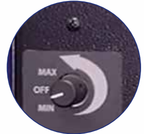
Variable Output, Timer Remote Included