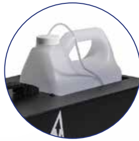
Built-in one gallon jug holder